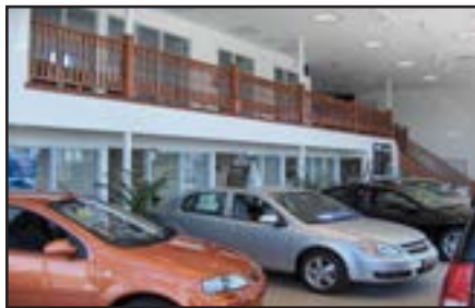
This mezzanine at Upper Canada Motors is used for additional office space.

Add a new loading dock. Adding a new loading dock can improve the traffic flow in an existing building.