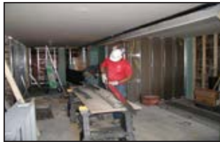
Unused office space is converted to a pub. See article on The Red George for more info.