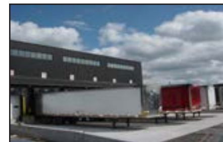
New loading docks at 3M.