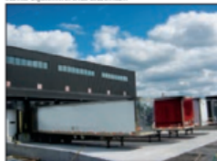
Loading dock at 3M.