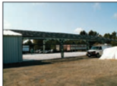
Second expansion at Dura Electronics.